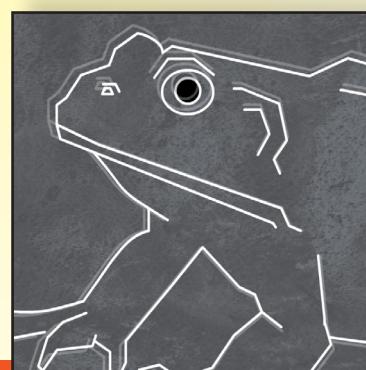
Raoul Olou Burn Out

Trigger warning: Animated films and Q&A discussion may contain sensitive content and/or potentially triggering material including issues of mental health, grief, death, and suicide.