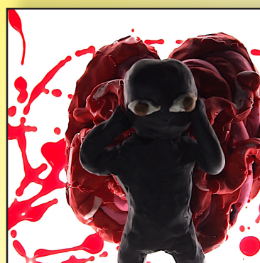
M.C Cruz Root Causes