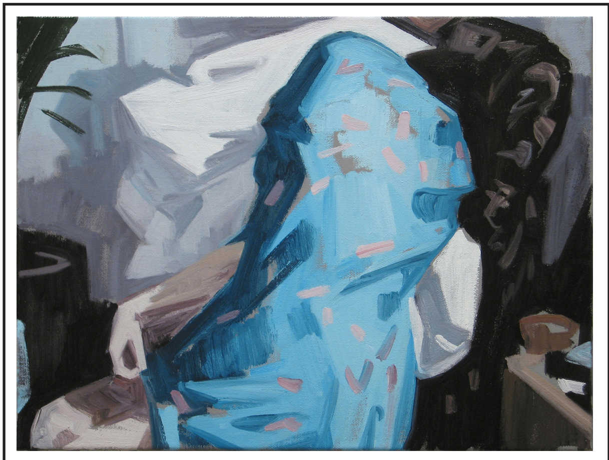
Blue, oil on canvas 12"x16" 2016