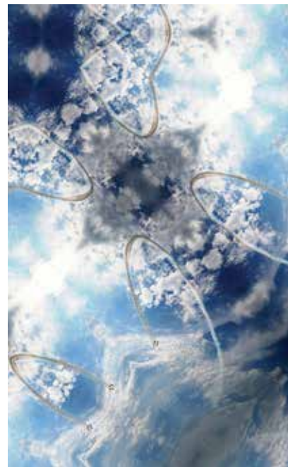
Sanaz Mazinani, Blue Angels (detail), 2013