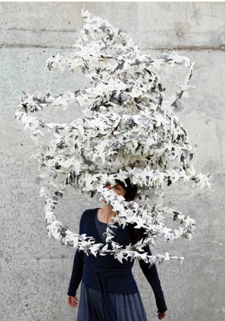
Meryl McMaster, Murmur #3 , 2013