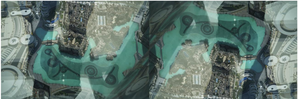
Arabesque 1, 2019, Chromira print on aluminum composite panel, 52" x 20"