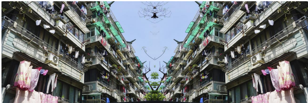
Garments and Splendors, 2019, Chromira print on aluminum composite panel, 52" x 20"

Taken during his travels to Hangzhou, Berlin and Dubai, Spicanovic's collection of photographic prints transform seemingly ordinary cityscapes and structures into extraordinary passages between observation and imagination and the poetics of the seen and the unseen . His long-time interest in cities and architecture, and his research into aesthetics and visual perception drive the photo-based works in this exhibition.