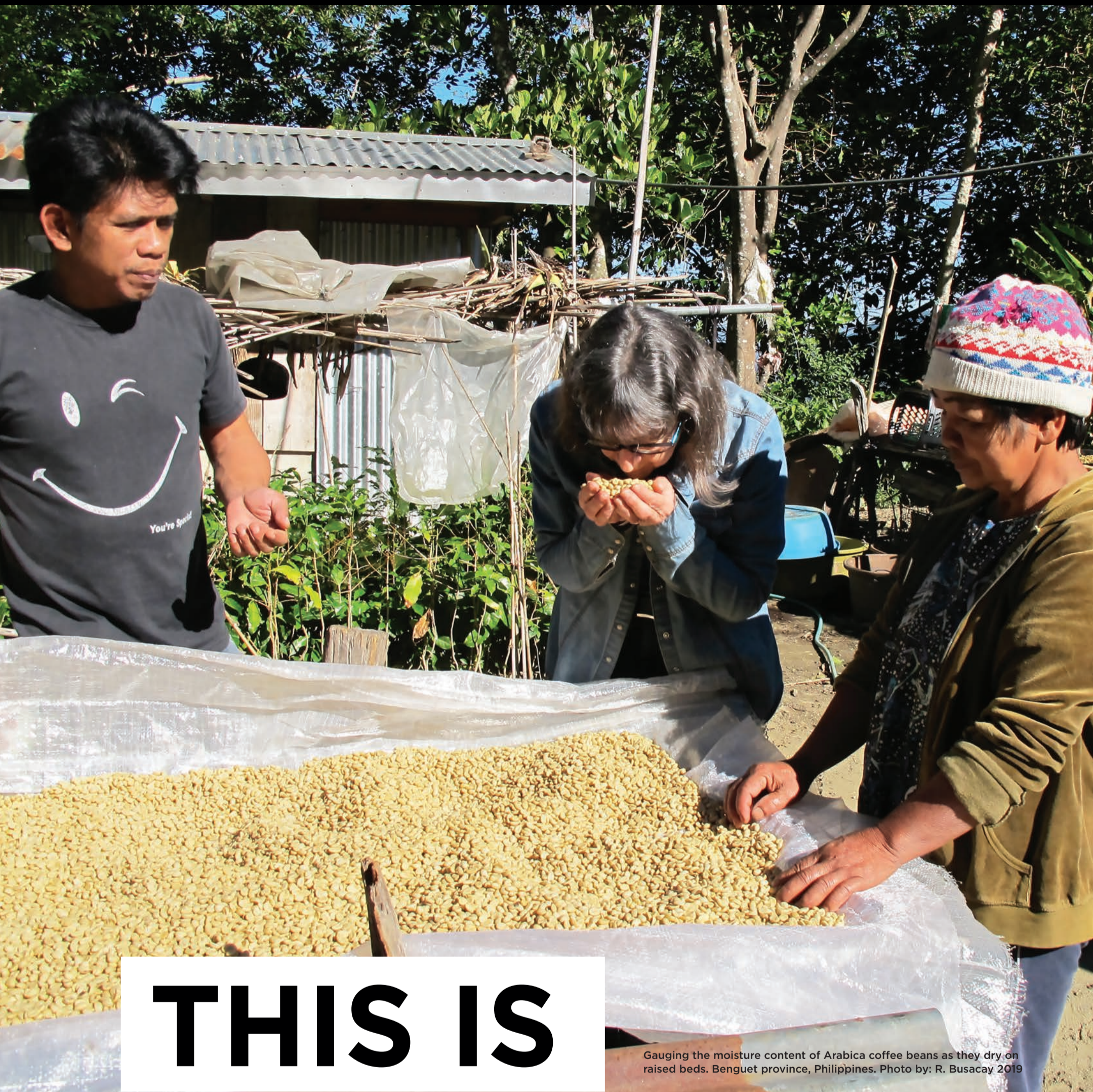
Gauging the moisture content of Arabica coffee beans as they dry on raised beds. Benguet province, Philippines.