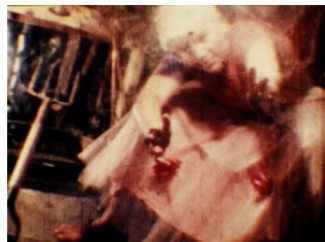
What Isabelle Wants