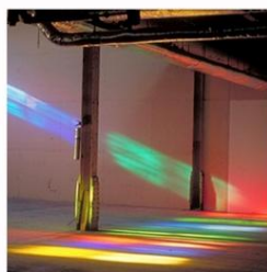
Doreen Balabanoff, Colour Chord Installation (detail)