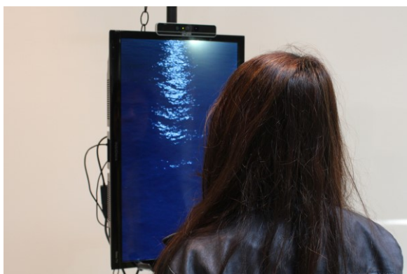
Figure 1: Your Body of Water aesthetically visualizes a visitor's heart rate from a 3D camera.