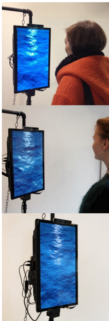
Figure 4: Your Body of Water display set up.