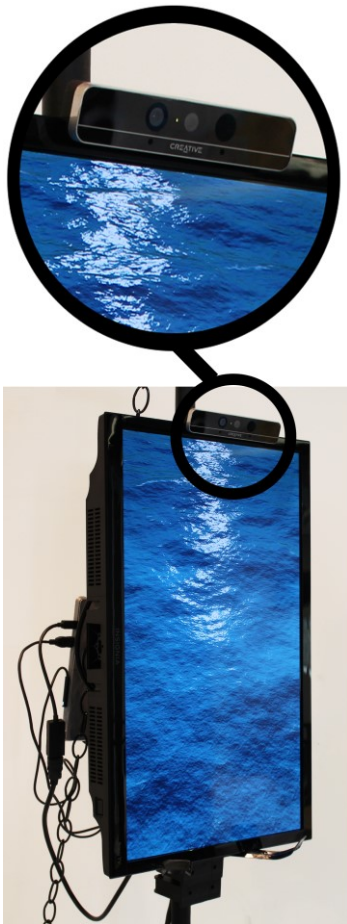
Figure 2: The Intel RealSense camera sitting on top of the display.

visuals. These projects have demonstrated the importance of real-time feedback, accurate sensors, room for reflection and environment to aestheticized heart rate visualizations. Among the biofeedback artworks that visualize aesthetic heart rate data, most of them gather pulse from the hand, and the Arduino pulse sensor[7], which attaches to an individual's index finger. During each of these projects participants were tethered to the device and in doing so the design itself signaled that it was reading heart rate.